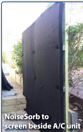
NoiseSorb to screen beside A/C unit